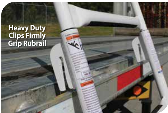
Heavy Duty Clips Firmly Grip Rubrail